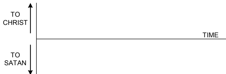
Figure 2 - Time and Progression